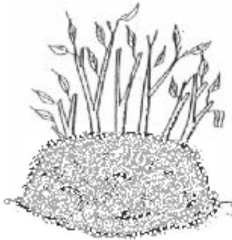
Pile shredded or chopped dried leaves over crown of plant. Cover crown and canes to a depth of 8-12".

Mulch plants in late fall, after two hard freezes (when the temperature has dropped below 15-20 degrees F.). Cover crown and canes of plant with shredded or chopped dried leaves to a depth of 8-12". Below are two methods of mulching. The chicken wire helps to contain the mulch.