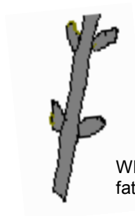
When pruning, be sure to leave at least two fat buds on each cane.

In the spring, after the last hard freeze, you may prune plants to remove dead or damaged stems. Be careful to leave at least two fat pairs of buds on each cane to ensure good blooming.